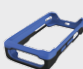
■ 94ACC0132 Rubber Boot