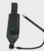
■ 94ACC0133 Hand Strap (Included with purchase)