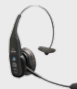
■ 95ACC0002 Bluetooth Headset VX1 B350-XT