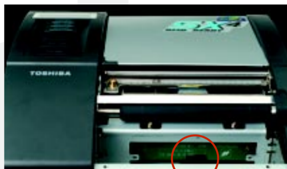
▲ UHF RFID antenna