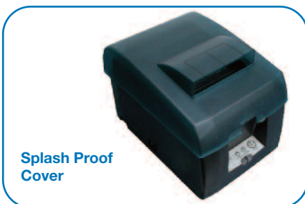
Splash Proof Cover