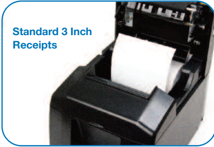
Standard 3 Inch Receipts