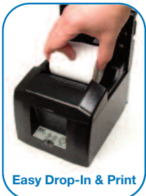
Easy Drop-In & Print