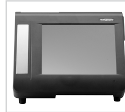
10.4" TFT-LCD touch screen