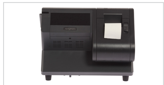
80mm Epson thermal printer with auto cut and paper feed