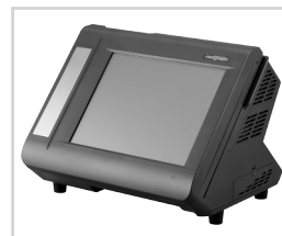
Compact and small foot print