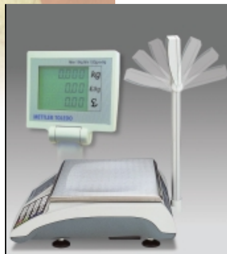
Clear customer display